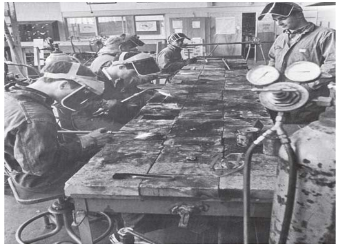
Welding Class - 1968