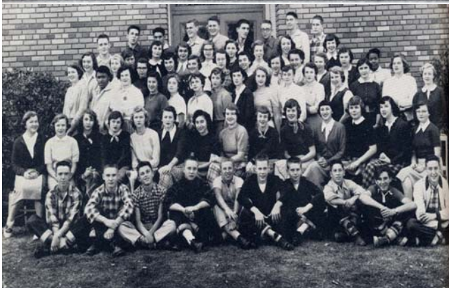
Class of 1953 Girls of 1972