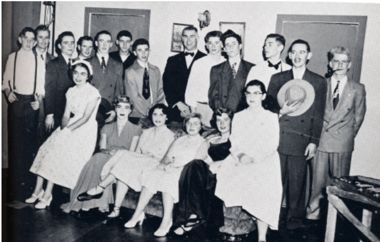
Junior Play - 1954