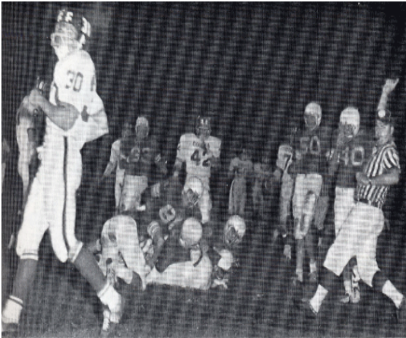
Colusa vs. Lincoln - 1972