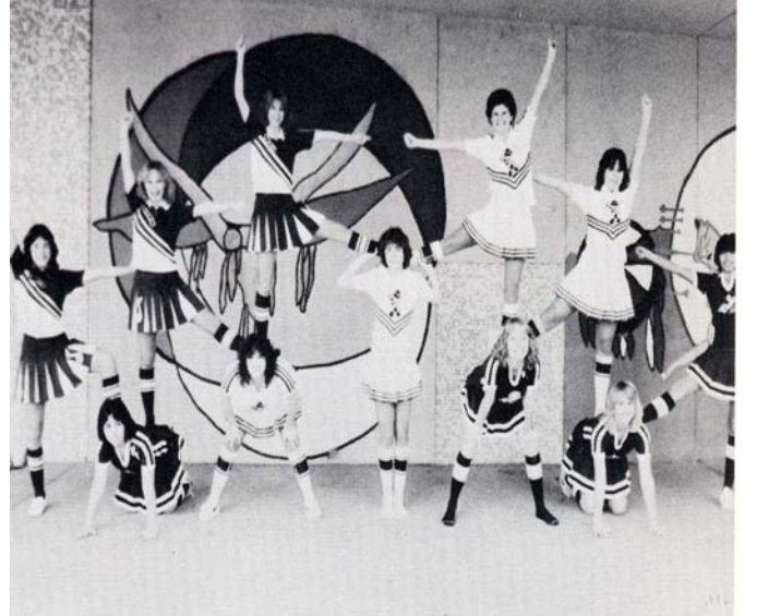
Cheerleaders & Pep Squads - 1983