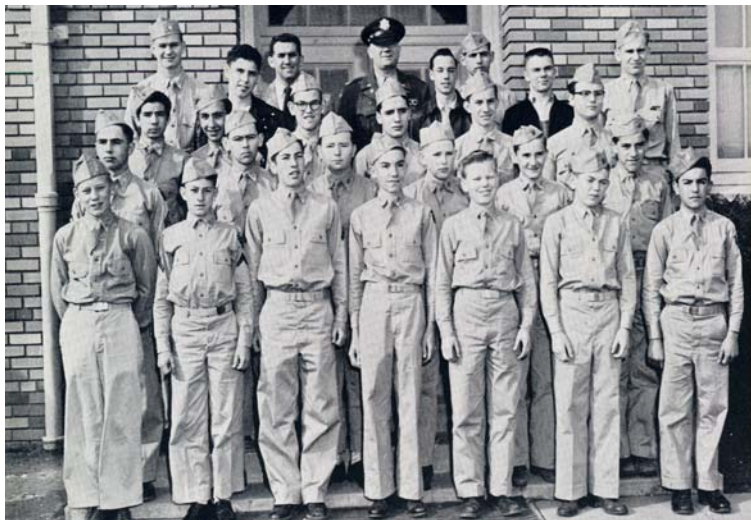
Cadets - 1954