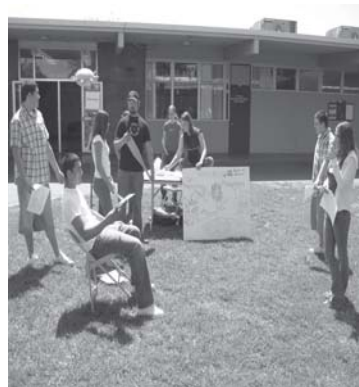
Sophmores from the class of 2009 prepare for the California State Standards Biology Test